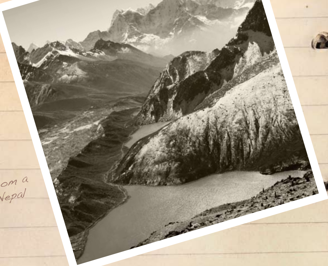
The view from a glacier in Nepal

‘ T hat woman in the dress and bracelets is my dad!’ I heard my six-year-old son protest indignantly on the other side of the supermarket shelves. When I joined him, pushing my loaded trolley, he explained: ‘Pa, those people are looking at you and talking behind your back.’