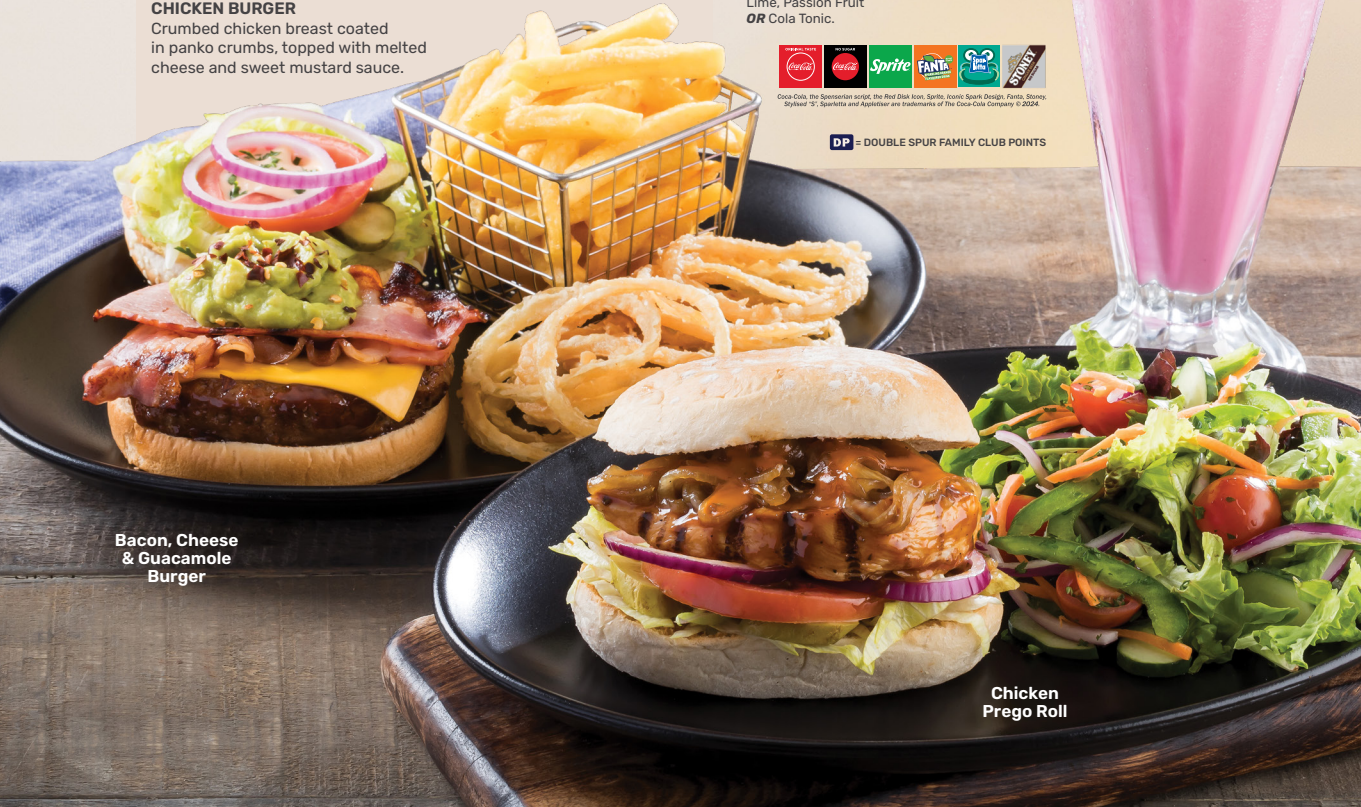
Bacon, Cheese & Guacamole Burger