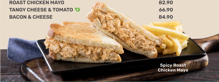
Spicy Roast Chicken Mayo