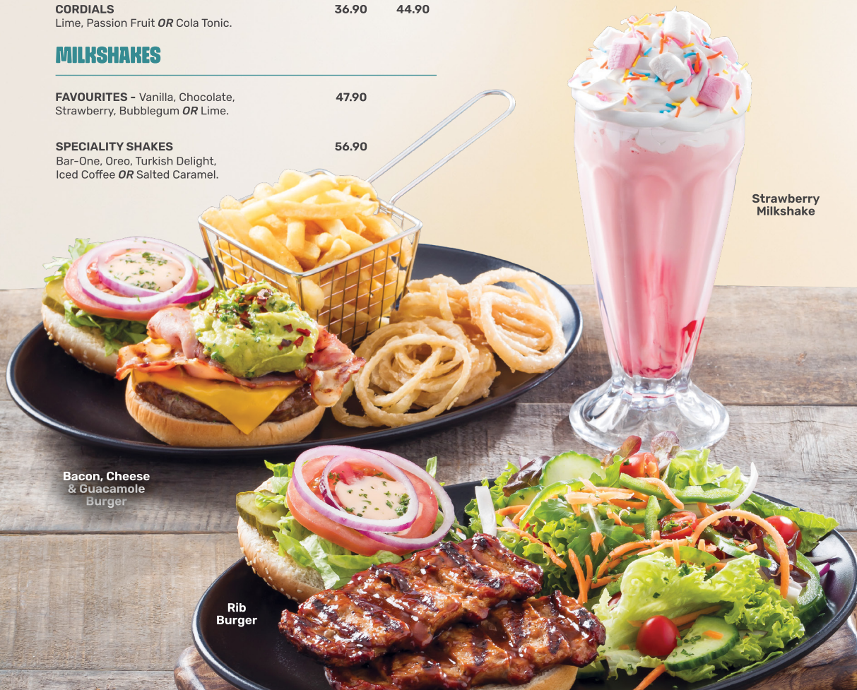
Bacon, Cheese & Guacamole Burger

BUFFALO WINGS Served with Durky Sauce and Roquefort dressing. 16 wings – 199.90