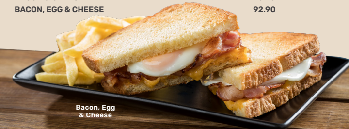
Bacon, Egg & Cheese